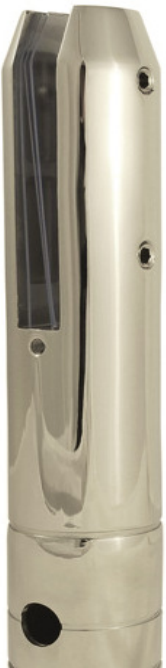
Round in ground