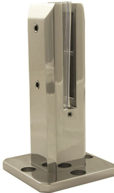
Square bolted down