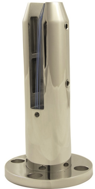
Round bolted down