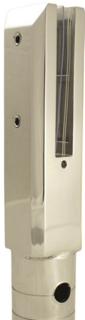
Square in ground